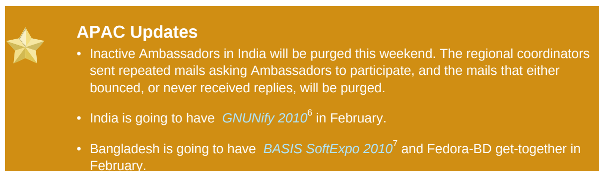
Table 1.4. APAC Events